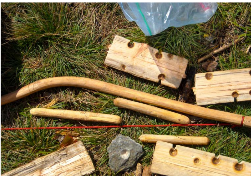
fig. 2. Giving/Receiving: A student in Trails Carolina's wilderness program gave these bow drilling objects to his parents, which they will carry home with them. In giving the kit (used to build a fire), he is sharing his story, his primal power, and expressing his need to experience continuance with the family. In receiving the kit his parents contribute to his trauma recovery, resilience, and stabilization.