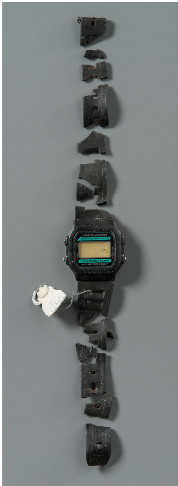
COLLECTION 9/11 MEMORIAL MUSEUM, GIFT OF SUSAN OULTY. PHOTO MATT FLYNN