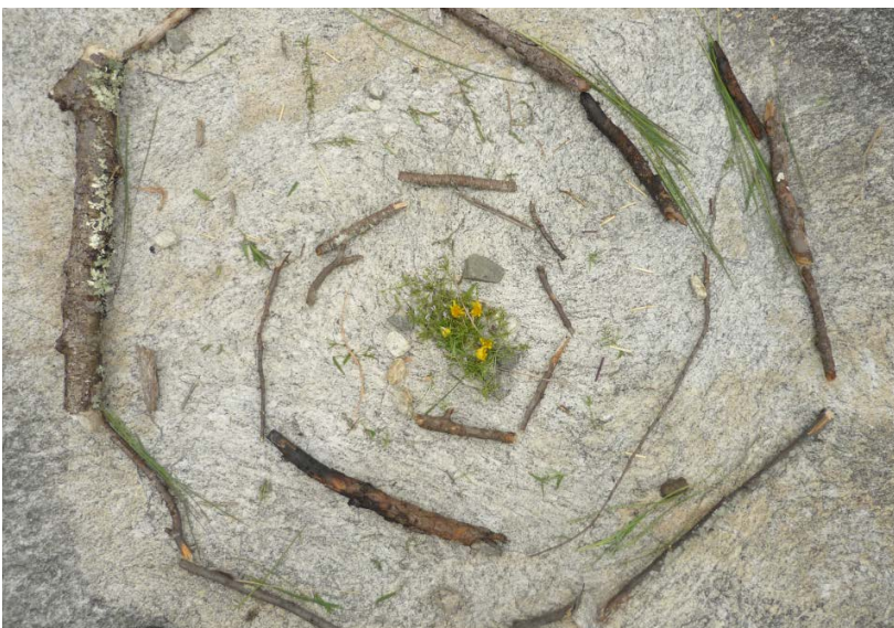
fig. 3. In object-based therapy, composing objects enables a participant to focus on the ways in which juxtaposition expresses thoughts, feelings, and concepts that are difficult or impossible to convey in words. To the student at Trails Carolina, this composition of sticks, leaves, and stones transcends spoken communication and describes an emotional experience she is unable to verbalize.